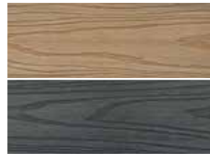
Natural Oak & Slate