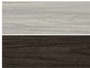
Antique & Carbon

HD Deck® Dual is dual-colours – two colours in one board!