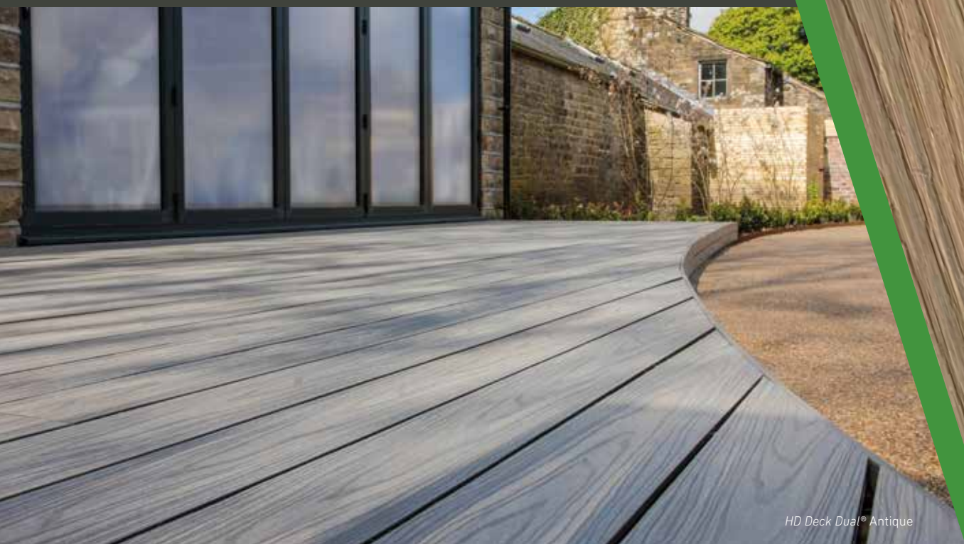
HD Deck Dual® Antique