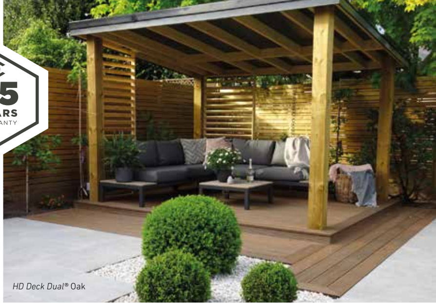
HD Deck Dual® Oak

HD Deck® Dual is our most natural looking wood plastic composite deck. With its 'capped' design creating a protective layer that offers maximum protection against stains and the elements for an extra long life. HD Deck® Dual takes composite decking to the next level.