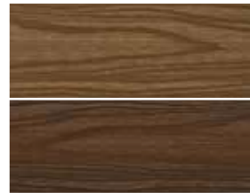
Oak & Walnut