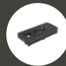
Universal Clip & Screw