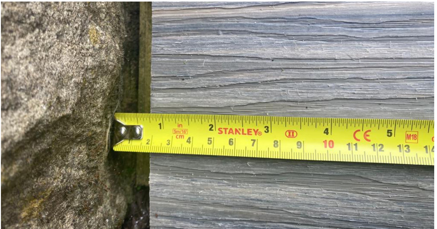
Expansion Gaps at Wall