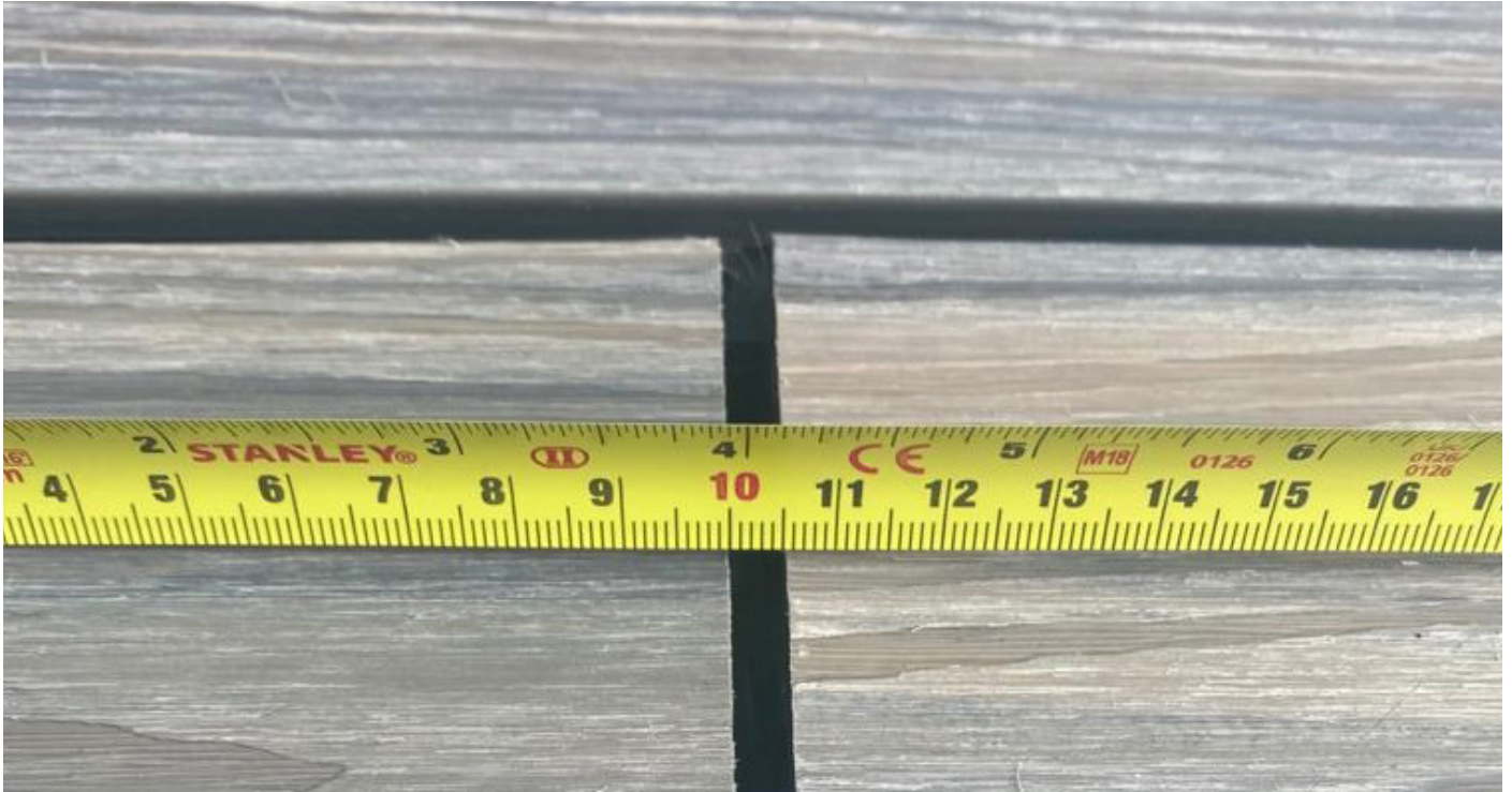
Expansion Gaps at Board Ends